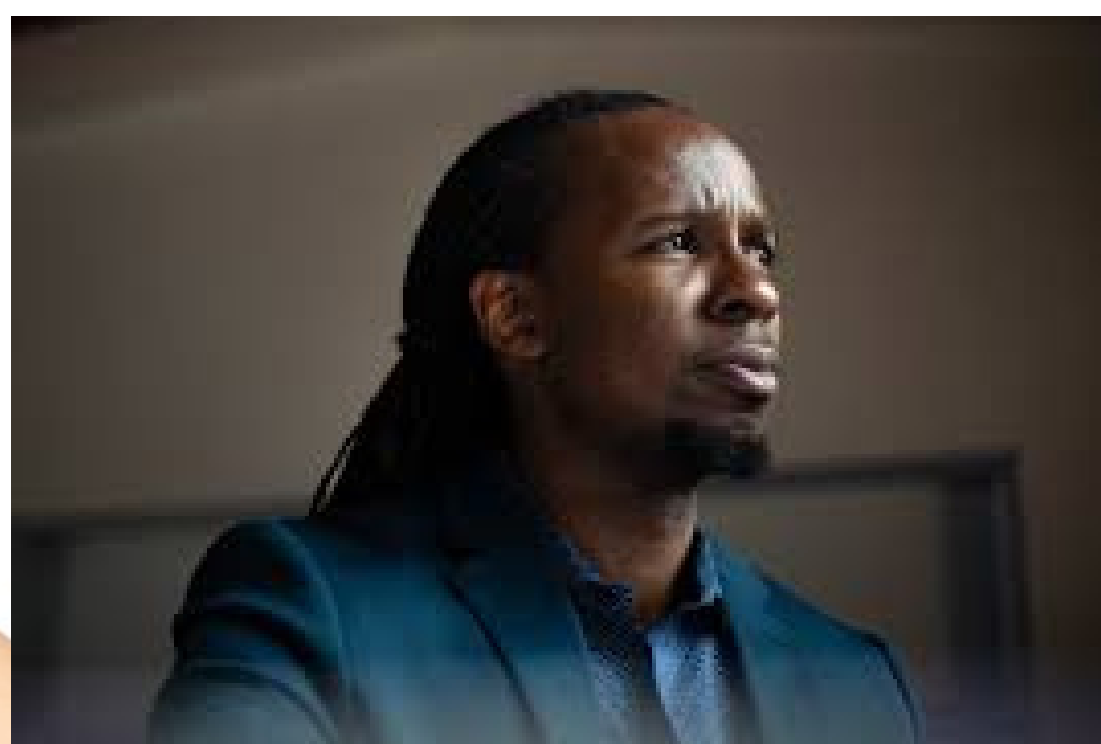
Author Ibram X. Kendi

This series is co-sponsored by Mission, Values & Inclusion, Task Force for Dismantling Racism, Staff Association Professional Development Committee, and Faculty Development.